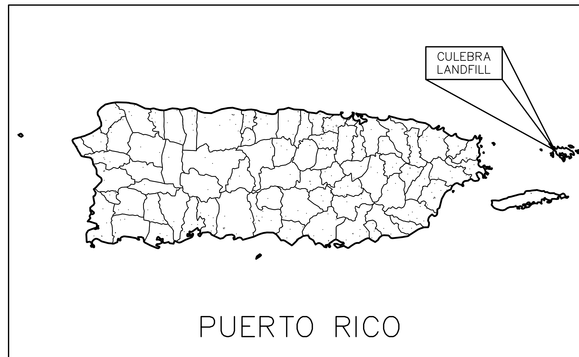
REGIONAL LOCATION MAP NTS

MALCOLM PIRNIE, INC. WHITE PLAINS, NEW YORK